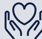
Grants and charitable donations